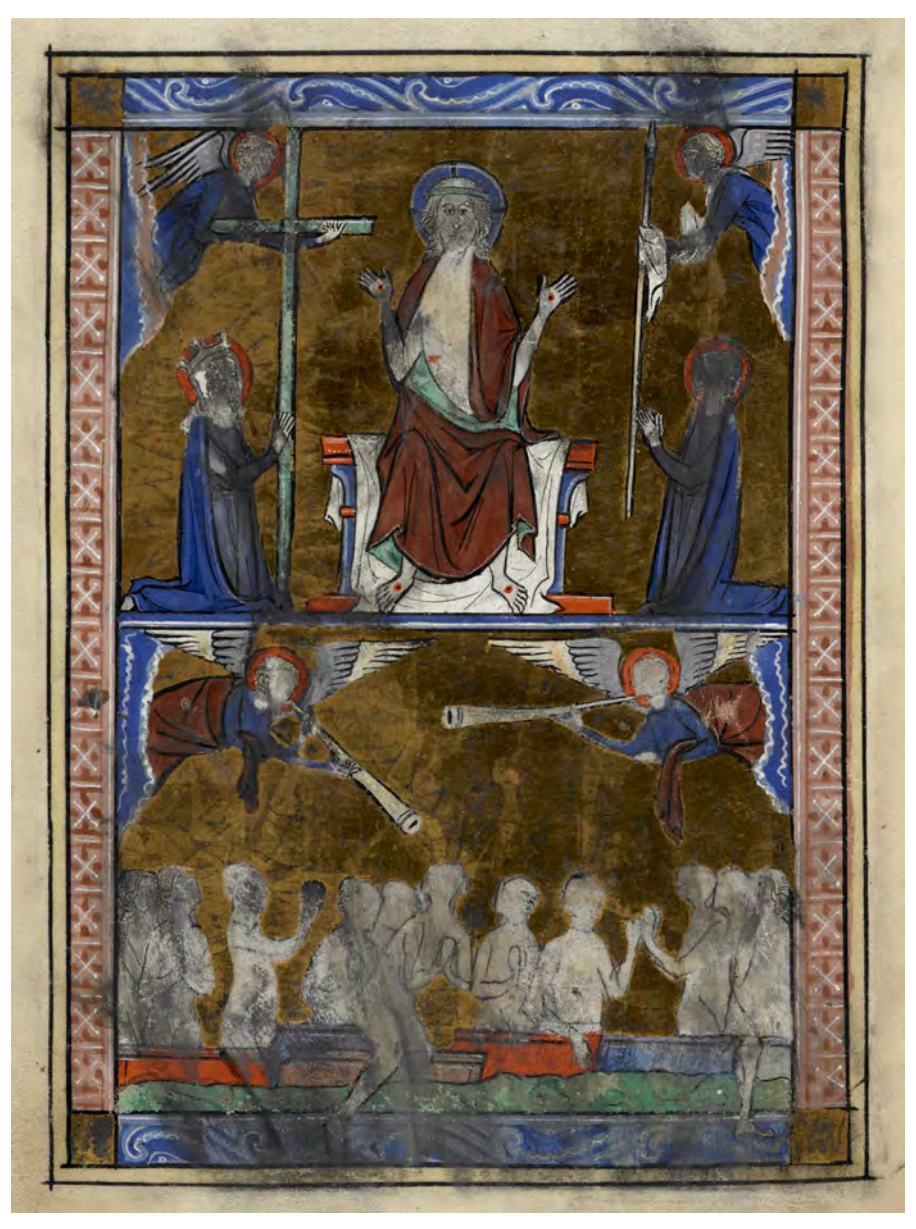
Figure 5. MS Additional 17868. Psalter. Last Judgement and the Resurrection of the Dead, f. 30v.