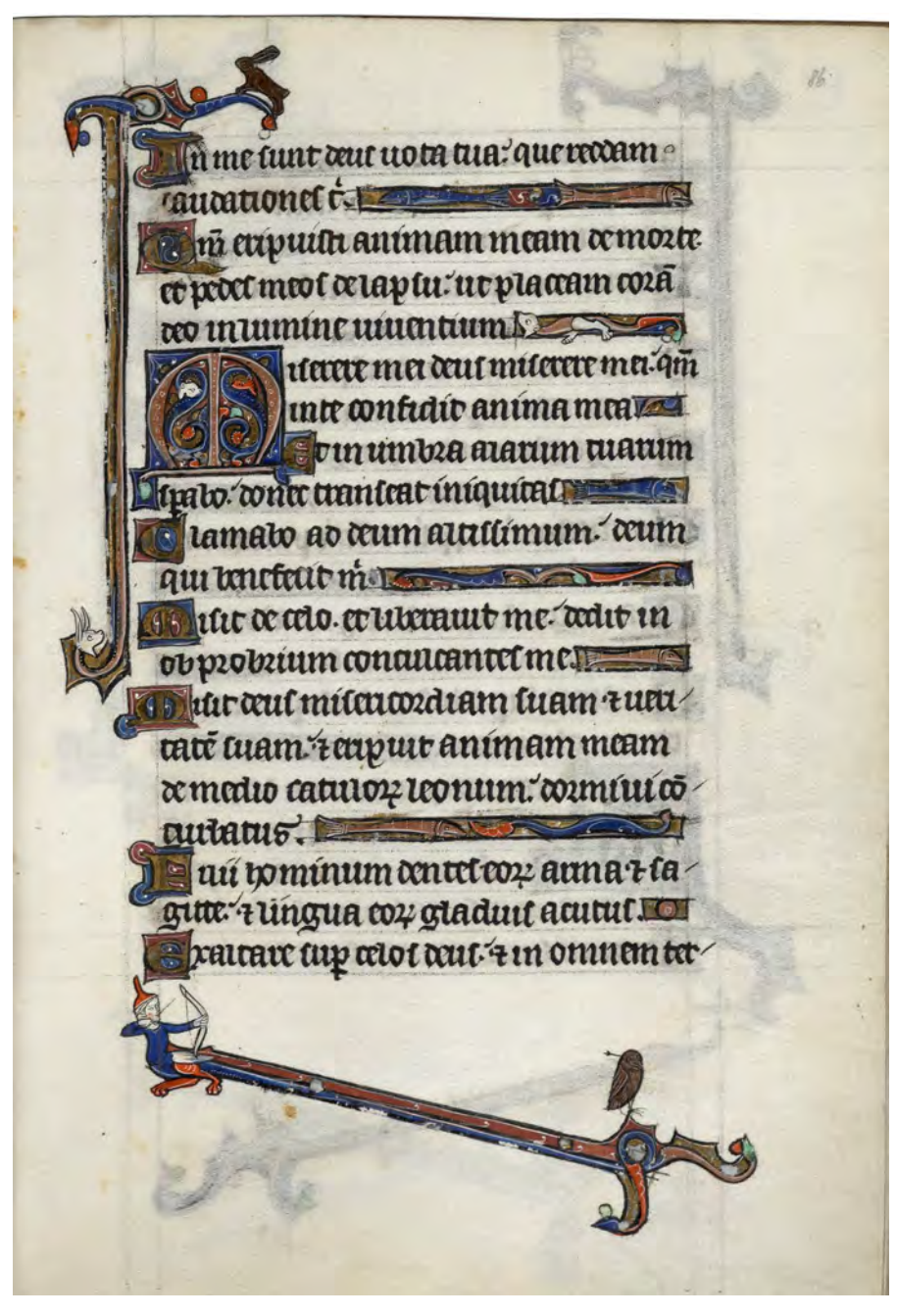
Figure 10. MS Additional 17868. Psalter. Psalms 55–56, f. 86r. (Photo: The British Library, London).