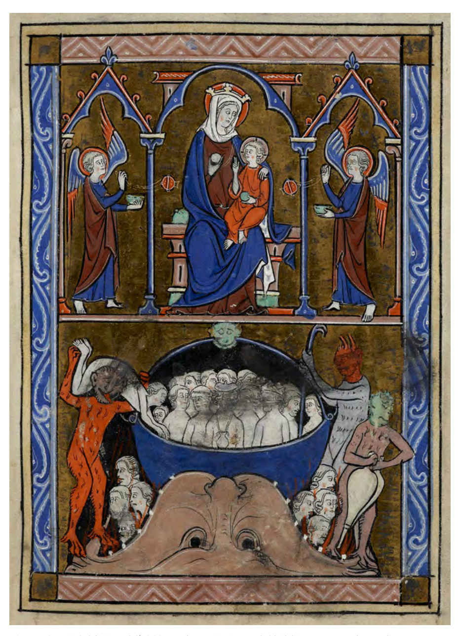
Figure 6. MS Additional 17868. Psalter. Virgin and Child in Heaven above the Torments of the Damned in Hell, f. 31r.