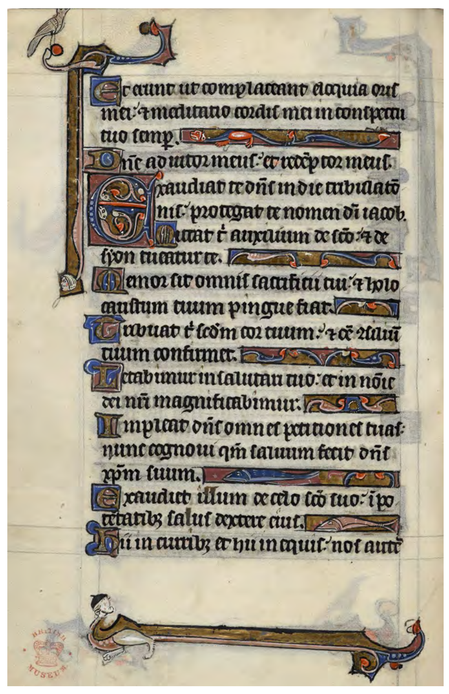
Figure 9. MS Additional 17868. Psalter. Psalms 18–19, f. 49v. (Photo: The British Library, London).