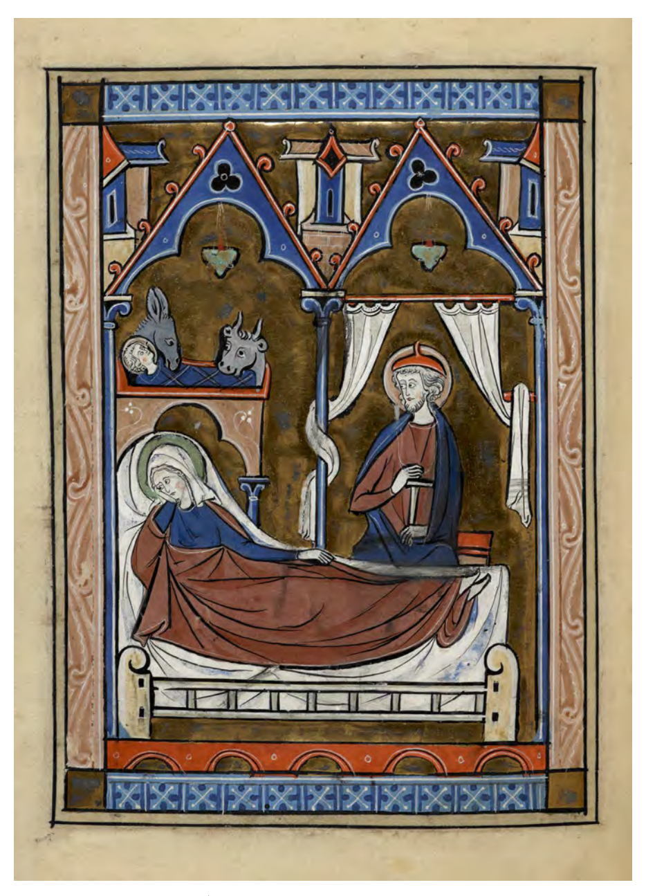
Figure 1. MS Additional 17868. Psalter. Nativity, f. 16v.