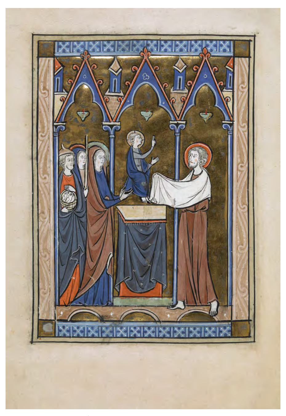
Figure 2. MS Additional 17868. Psalter. Presentation of the Child in the Temple, f. 18v. (Photo: The British Library, London).