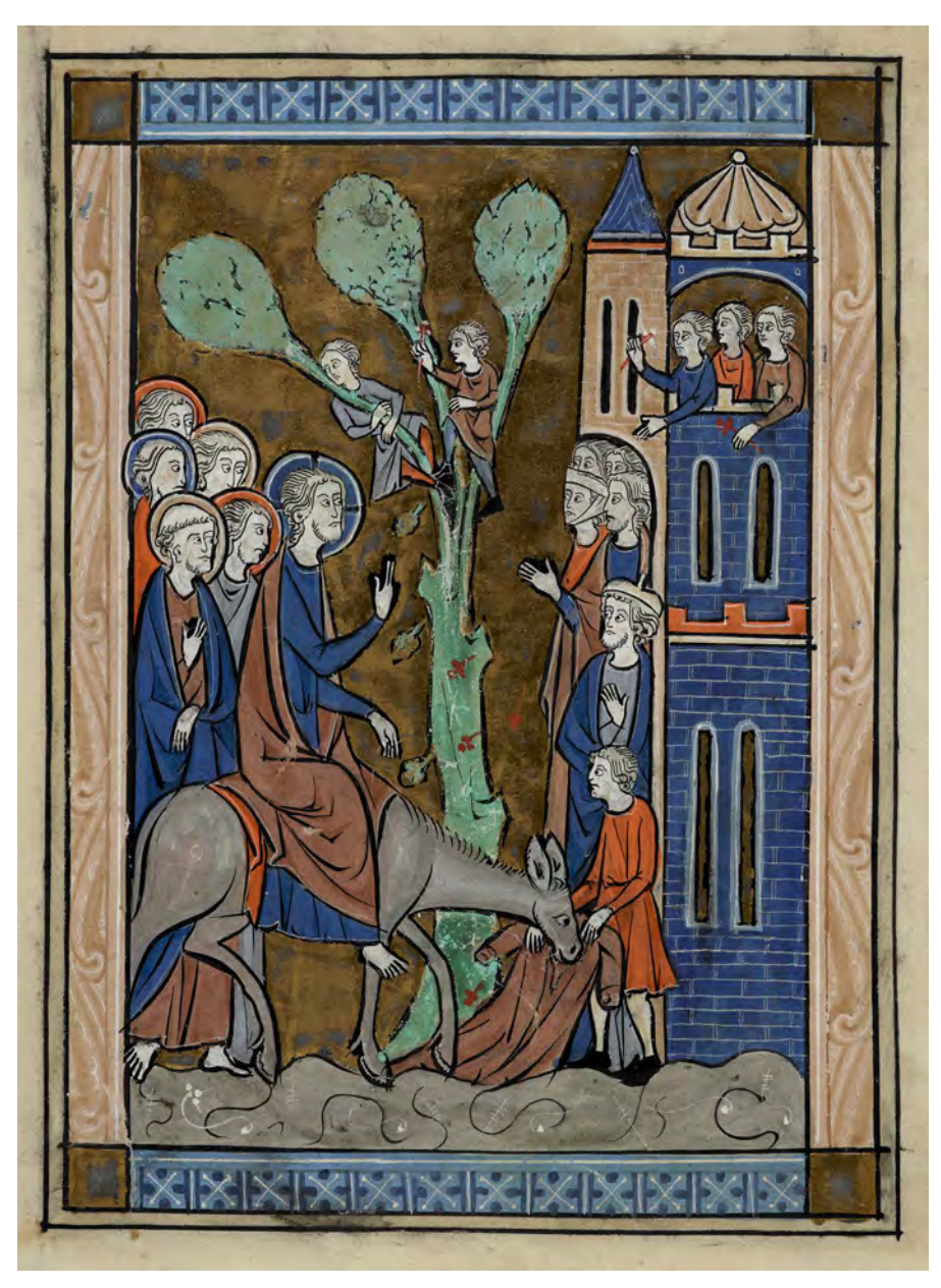
Figure 4. MS Additional 17868. Psalter. Entry into Jerusalem, f.22v.