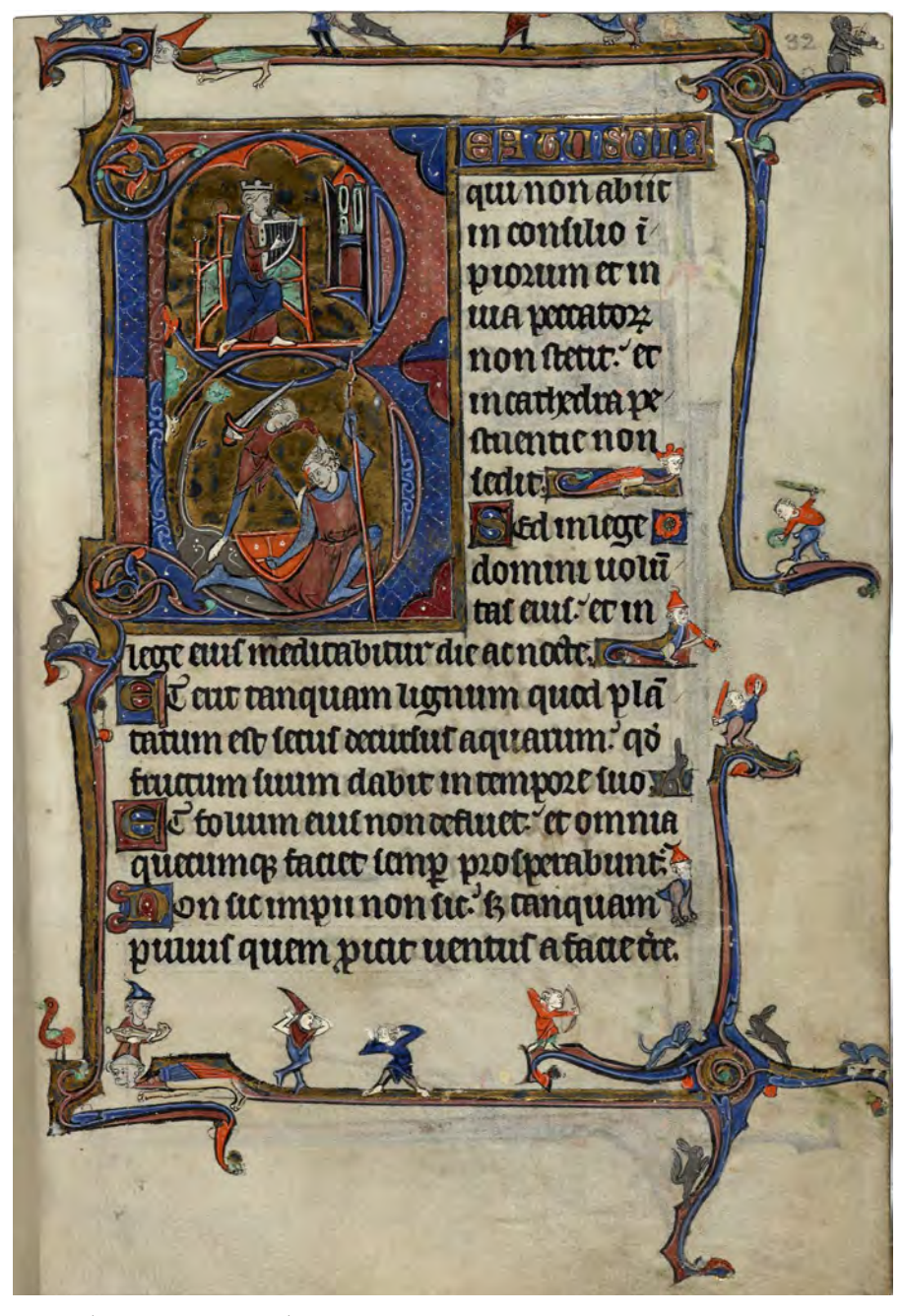
Figure 7. MS Additional 17868. Psalter. Psalm 1, f. 32r.