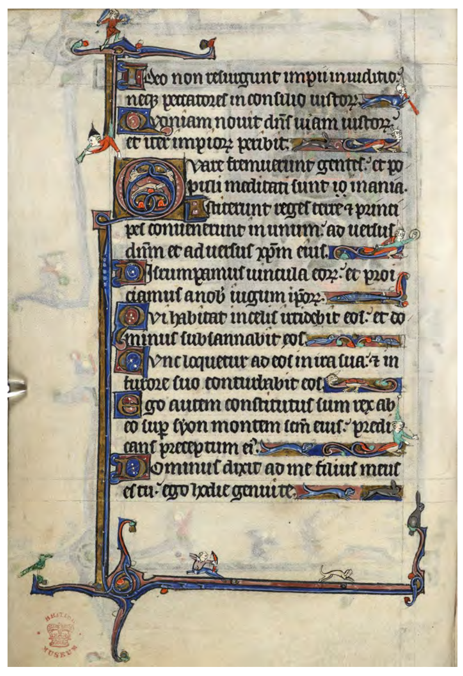
Figure 8. MS Additional 17868. Psalter. Psalms 1–2, f. 32v..