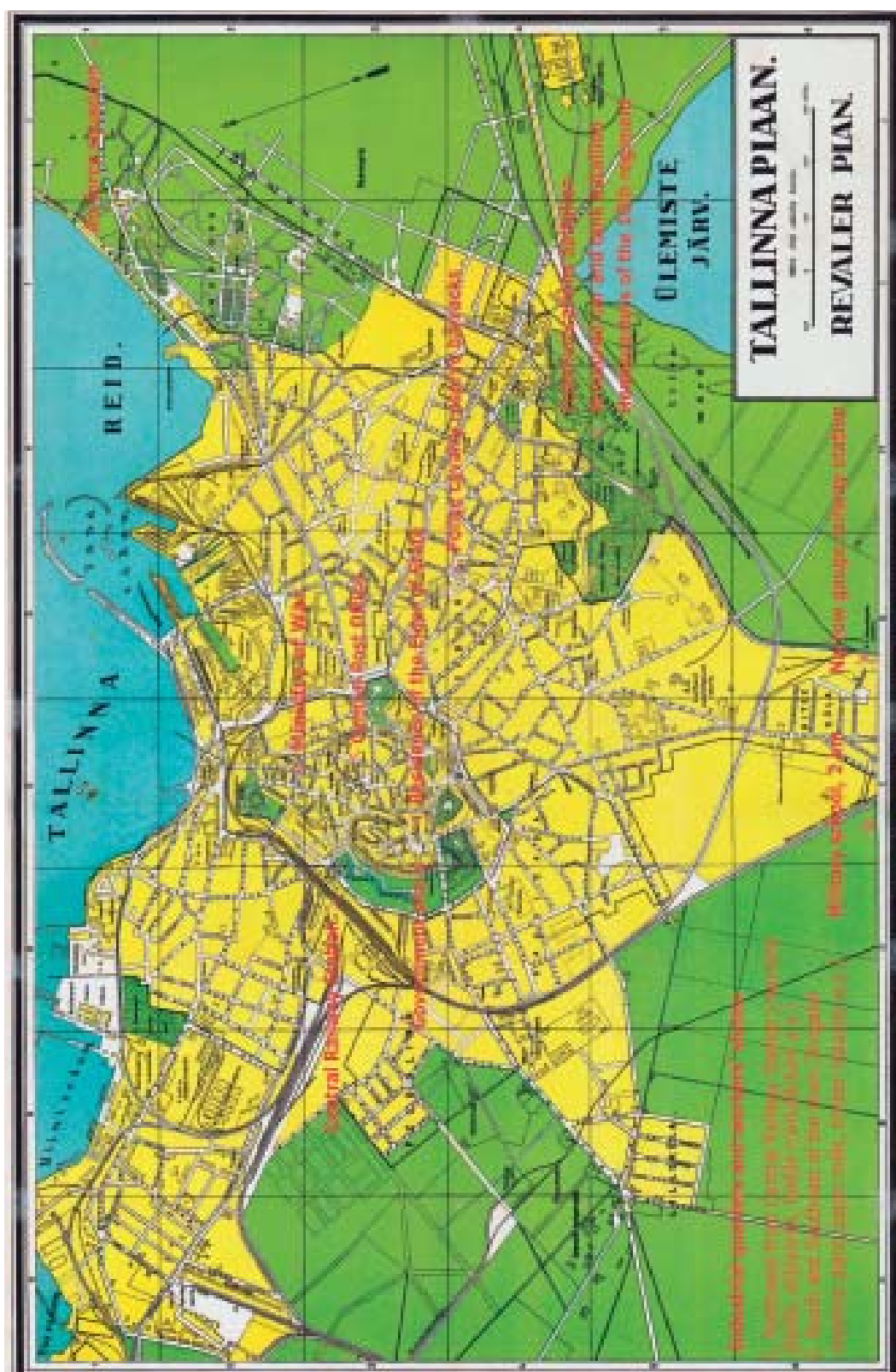
Map of Tallinn from 1927 (published by the Üldise Ajakirjanduse Kontor (G. Paju), digitalized by Estonian National Library, http://www.digar.ee/id/nlib-digar:262534 ) with the author's markings for the places of the key 1 December 1924 coup events.