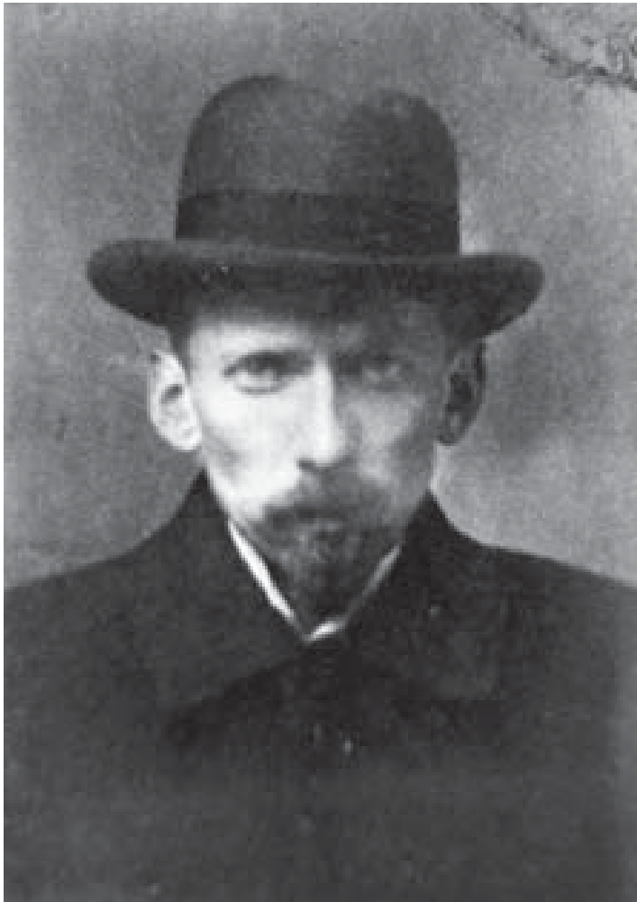
Viktor Kingissepp in 1918. Photo is taken in Moscow

ved the incorporation of the counties with Estonian population of the Estland and Livland provinces into one autonomous Estonian province. The permission was also given to form national Estonian units of the Russian Army. During that spring the Russian Army was demoralised and lot of units were taken over by the soldiers' committees; so tens of thousands of Estonians, mobilised to the Russian army, could return to their homeland due to that permission. In January 1918 there were four infantry regiments with cavalry and artillery and the headquarters of the 1st Estonian Division.