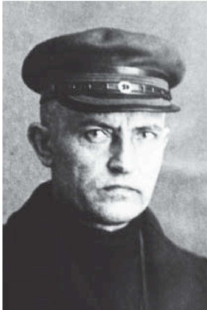
Jaan Anvelt, the coup leader, in 1925.

nist organisations. Hundreds of Communists were sentenced at the Military Circuit Court from 1920 to 1925. Most were young men and women in their 20s and 30s. 13 The largest of the trials against the Communists, the “ Trial of 149 ” in November 1924, will be analysed below.