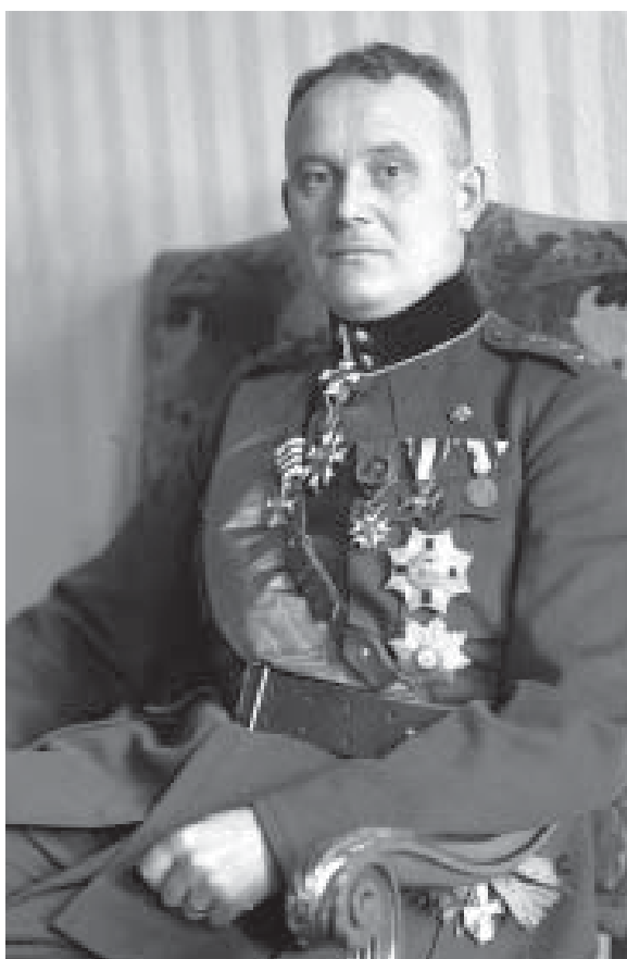
General Johan Laidoner was returned to duty as Commander-in-Chief as part of the political reaction to events.

with headquarters in Tallinn, commanded by Major General Aleksander Tõnisson.