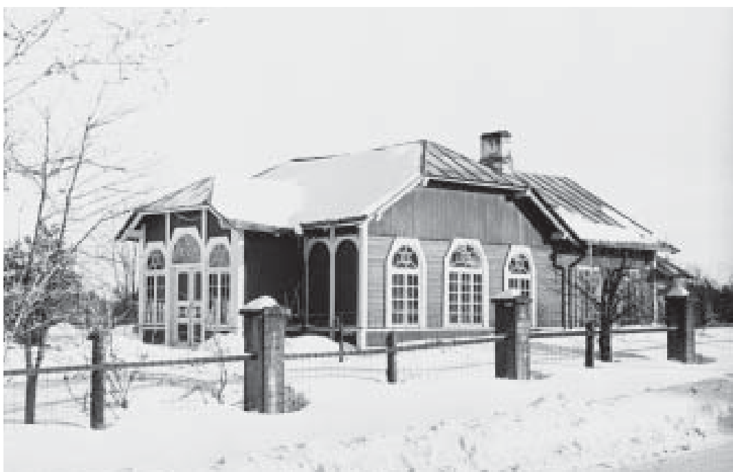
The safe house (of the caretaker of Tallinn Jewish cemetery) where Jaan Anvelt, Viktor Kingissepp and Otto Rästas lived. Photo is taken in 1956

A secret printing shop was established in farms near Tallinn. Here the leaflets and underground papers were printed. The Second and Third Congresses of the Estonian Communist Party (ECP) were held in 1921 and 1922 in these farms. The underground work was not only kept going by revolutionary spirit of young people and meagre donations of the local supporters. Plentiful financial support came from Soviet Russia via Comintern. Viktor Kingissepp testified in 1922 to the Security Police ( Kaitsepolitsei ) that the underground movement in Estonia was financed monthly with 300,000 – 400,000 Estonian Marks through the Estonian Section of the Comintern. To compare: the monthly salary of the Commander in Chief of Estonian Armed Forces Lieutenant General Laidoner in December 1924 was 48,000 Marks. The farm where the secret printing shop of Communists was located was bought in 1920 for 300,000 Estonian Marks. In 1922 the Security Police found a warehouse with five tons of paper for Communist publications. 15