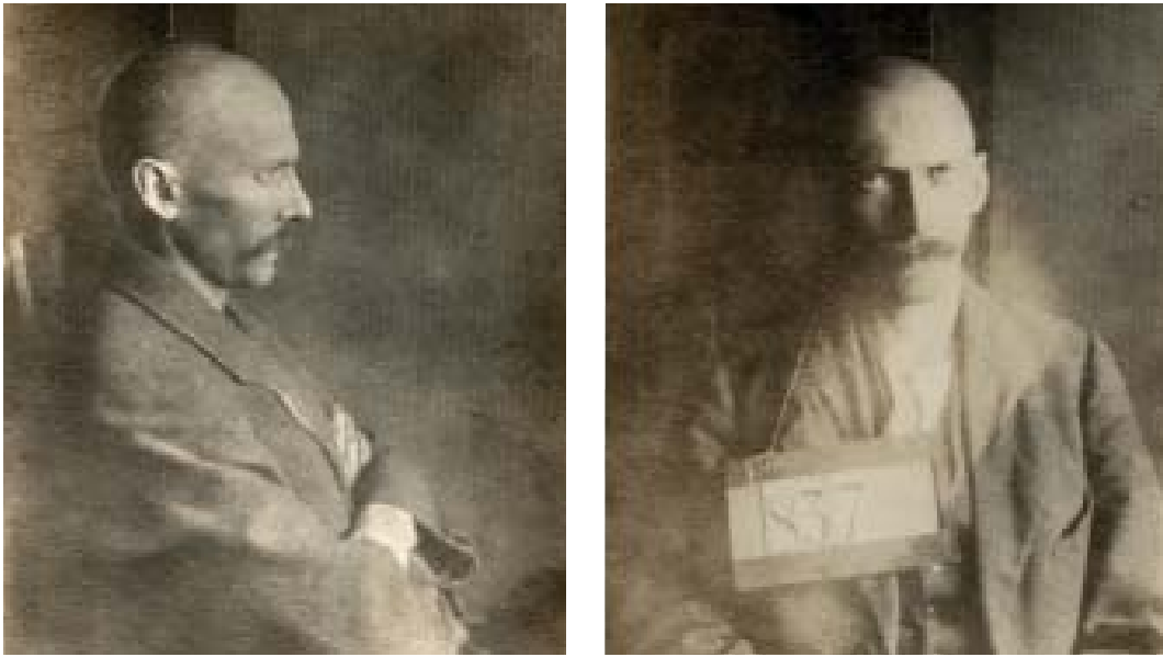
Kingissepp after his arrest

Tallinn in March 1923. They and a number of others were honoured as martyrs after World War II and their names were given to the streets and enterprises. Jamburg in Leningrad oblast was renamed Kingissepp in 1922. Kuressaare, the capital of island Saaremaa and the Saaremaa county, was named Kingissepp from 1952 to 1990.