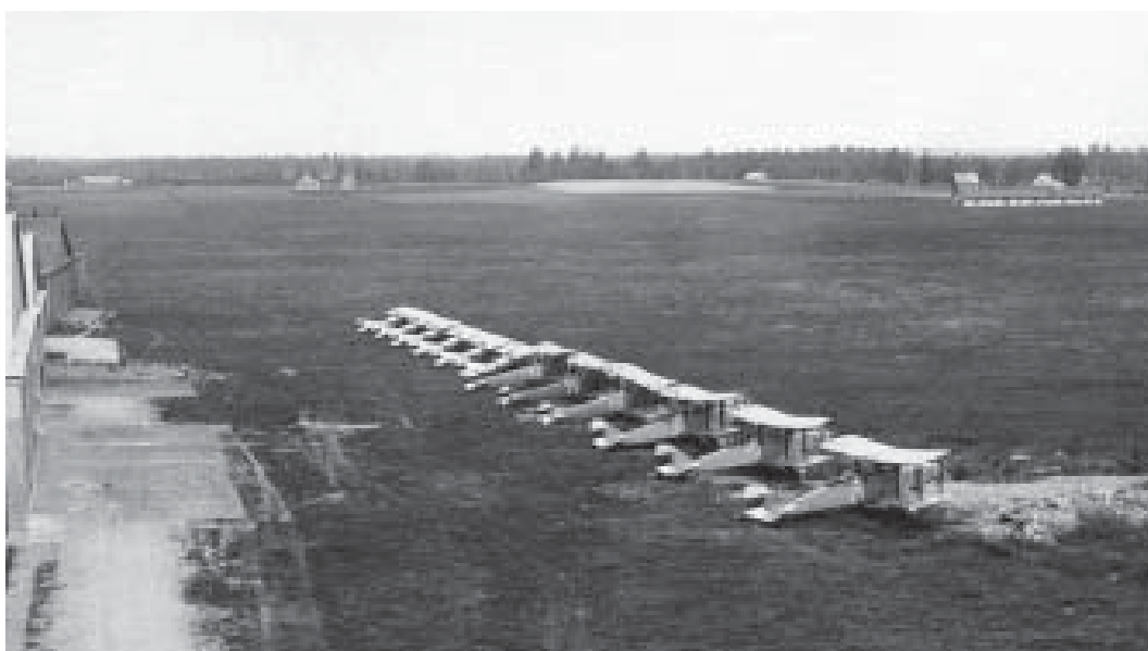
Reconnaissance and scout aircraft at the military airfield at Lasnamäe that came under coup control. ( http://jaakjuske.blogspot.com/ee/2014/01/lasnamae-unustatud-sojavelennuvalja.html )

fully taken over by the assault squad. The duty officer was captured, but before that happened he succeeded in informing other units about the attack.