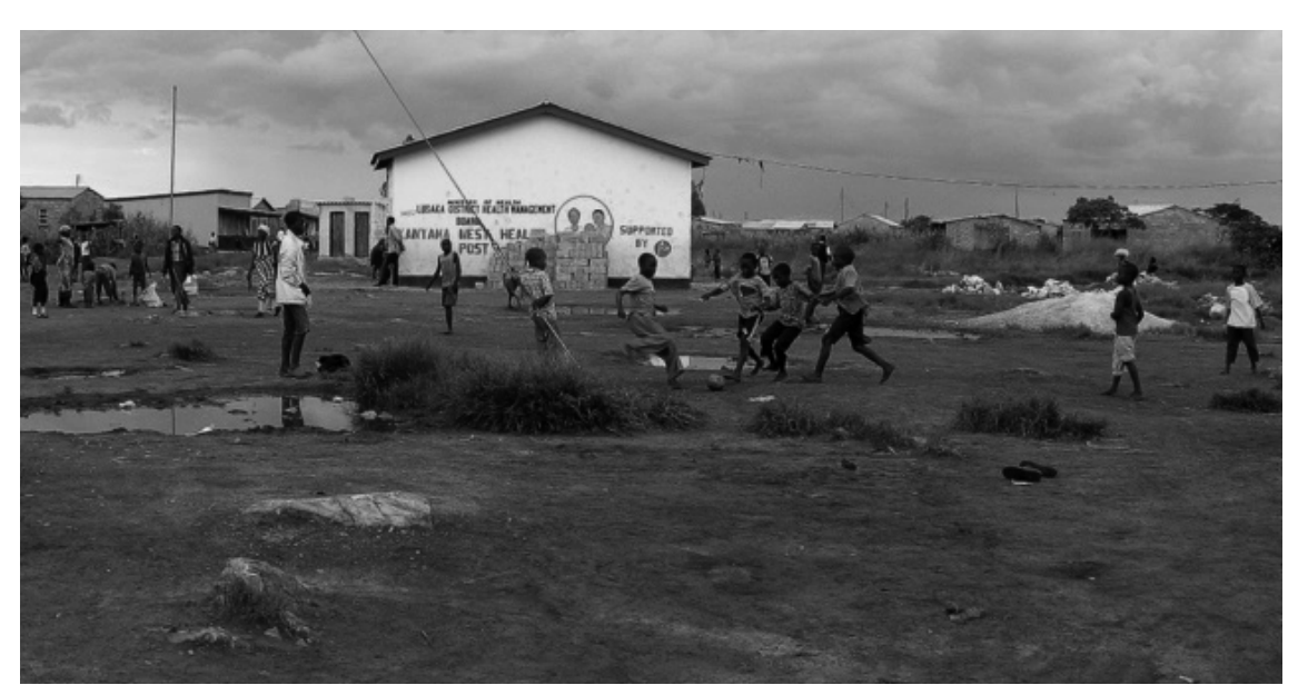
Soccer can be played everywhere - Casual soccer in a poor community in Lusaka.

Empirical findings show a tendency in Children doing Organised Sports (COS) to feel better about themselves in a variety of aspects when compared to Children Not doing Organised Sports (CNOS). COS are more likely to attend school and develop life skills while playing and having fun, and they usually have an adult caring for them – also outside of the pitch. Although there are significant differences be-