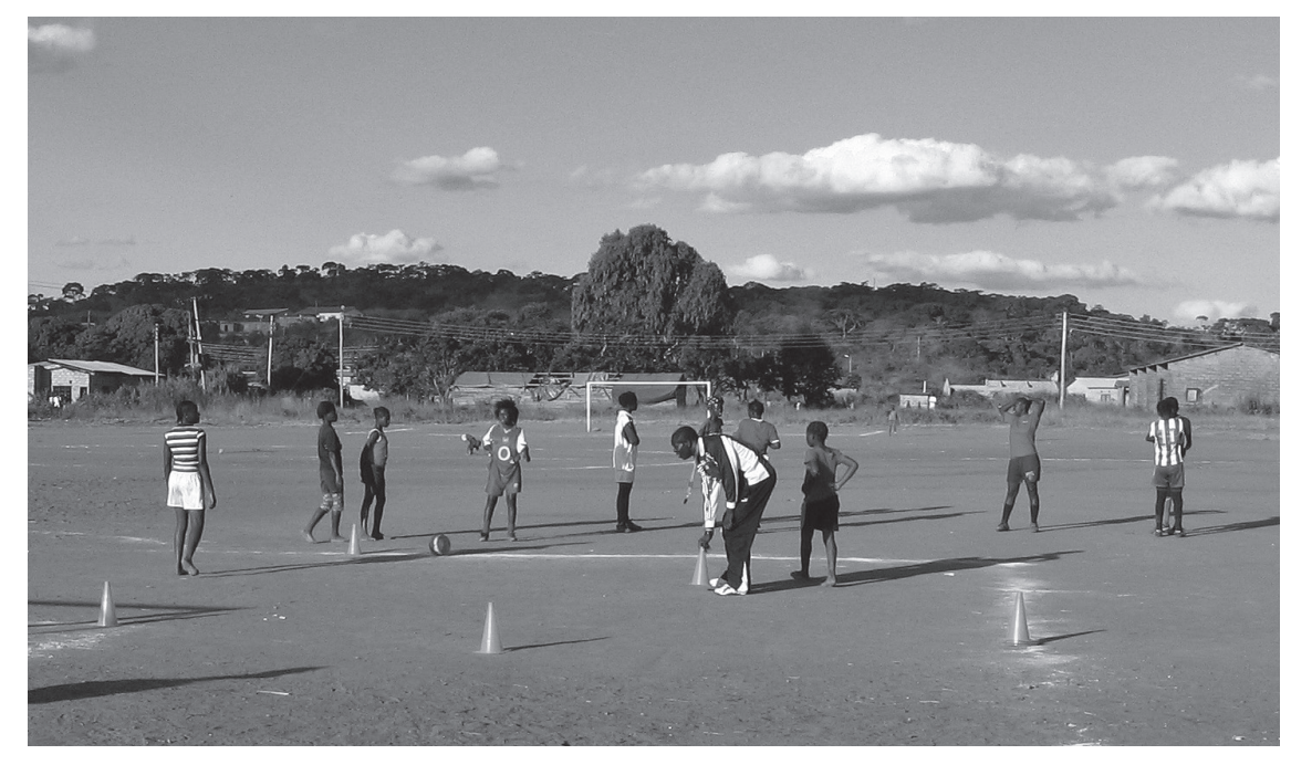
Girls' team from Bauleni United Sports Academy in Lusaka, Zambia.

insufficient it is possibly more important to be part of a context in which leadership skills can be fostered and developed.<sup>4</sup>