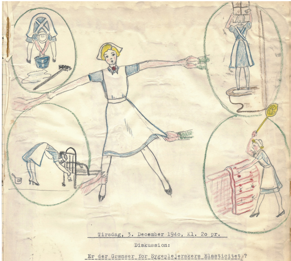
Figure 1: "Are There Limits to the Elasticity of Nurses?" 1940 42

and start a family while practising her profession. The religious calling was emphasized as a professional ideal in Danish Nurses' Organization's nursing textbooks from 1926 to 1950. Improvements similar to the scientification of training for nurses that took place in the US in the 1920s were not considered appropriate in Denmark - the prevailing opinion was that such changes would come at the expense of this calling. It was especially doctors who insisted that the calling preceded the nurses' training. 43 In 1933, a system of state authorization was introduced for nurses and training extended to a three-year programme. However, the content of the education was not uniform throughout the country, and although nursing gradually began to be seen as a profession, the idea of a calling remained dominant. It was not until 1956 that the Nightingale Pledge was replaced by a new pledge downplaying the religious aspects and based on a principle of conscientiousness and regulations. In 1979, such pledges were abolished for Danish nurses. 44