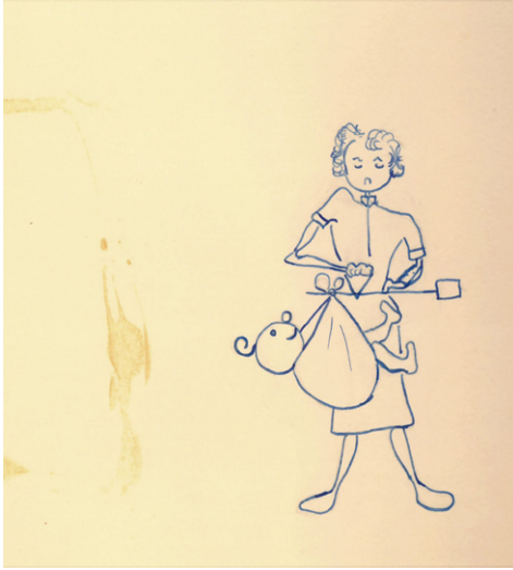
Figure 2: "Health visitor weighing a baby with a bismar scale", 1959 47