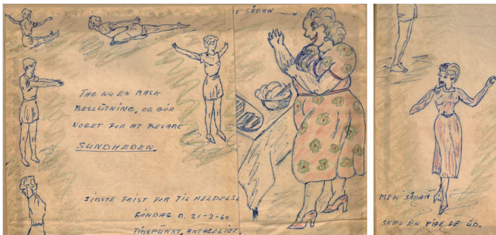
Figure 3: “Not like that, but this is what a girl should look like”, 1960 56

as a religious and female-only calling in 1938, with women expected to sacrifice their own needs in pursuit of this calling. 57 Thus, on one hand, it was considered a progressive step that nurses gained access to university in 1938, with the first students considered pioneers within their field. On the other hand, nurses were still bound by traditional views of women, education, and professions. This paradox symbolizes the border between the modern woman and the traditional nurse that I want to explore with the last example of a female figure that I have selected from the scrapbooks. Figure 3 presents a drawing from 1960, illustrating two women: one stout, one slim. In addition, active number of other women are depicted demonstrating gymnastic exercises. The drawing is an invitation, produced by the nursing students’ “Sports Committee”. It reads: “Tag nu en rask beslutning og gør noget for at bevare sundheden”. 58 Next to the drawing of the stout woman, who is standing at a dinner table with food in her arms, is written: “Ikke sådan”, and next to the slim woman is written: “Men sådan skal en pige se ud”. 59 The women performing gymnastics are dressed in shorts and t-shirts, the stout woman in a floral dress, while the slim woman is wearing a plain dress and presents herself gracefully, almost dancing.