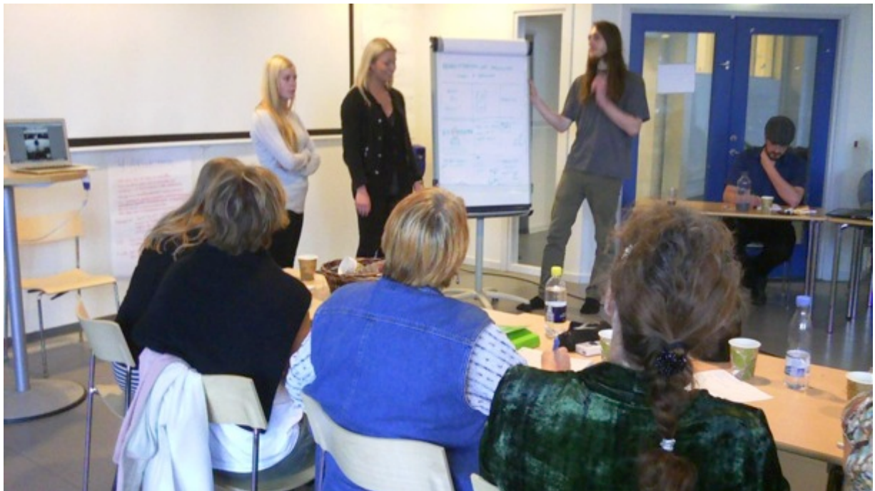
Image 5: students present their first prototypes to the various stakeholders in the project. They get feedback through collective reflection for the next iteration.

We teachers pre-arranged feedback sessions and the student work groups arranged meetings with other NGOs and representatives of volunteer organizations in order to test the initial design ideas and first prototypes. Groups were asked to collectively reflect on the (partly contradictory) feedback they got in relation to their idea, and renegotiate how the feedback would require them to adjust their design idea. Their design objects thus turned into socio-material public entities that were exposed to functional diversity and thereby invited controversies and renegotiations throughout the entire process. This process was also supported by the target stakeholders' explicit feedback and input.