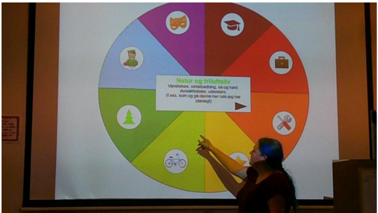
Images 3 and 4: students present their prototypes, in this case a visualization of an activity calendar via which volunteers and psychologically vulnerable people can meet around social activities.