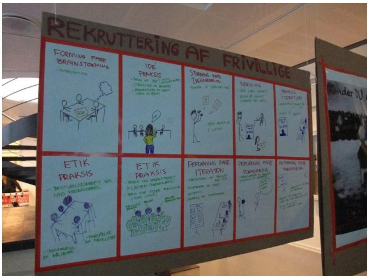
Image 1: Example of one of the design project's storyboards describing the design process involving meeting with different stakeholders and renegotiating the aim and purpose of the design idea. The storyboard is a designer's working tool to visualize the different phases of the design process. In this case it illustrates a recruitment campaign for volunteers and psychologically vulnerable people asking for social support.

that social anxiety would prevent peers from participating in social gatherings despite the fact that they very much would like to. It was also new to them that extreme obsession with one's own physical appearance could result in spending many hours in front of the mirror prior to a social event and even yield the result that someone would decide not to go out at all. It was also new to them that people with depressive periods would not necessarily be able to formulate their need for social contact. These kinds of distributed problems that emerged as a result from co-exploring functionalities and capabilities set the scene for the students' potential design ideas. The group then began to draw mind-maps, write post-its, create storyboards (see image 1) etc., illustrating their initial thoughts on how they themselves and people close to them could also be understood as holding a stake in the phenomenon of psychological vulnerability.