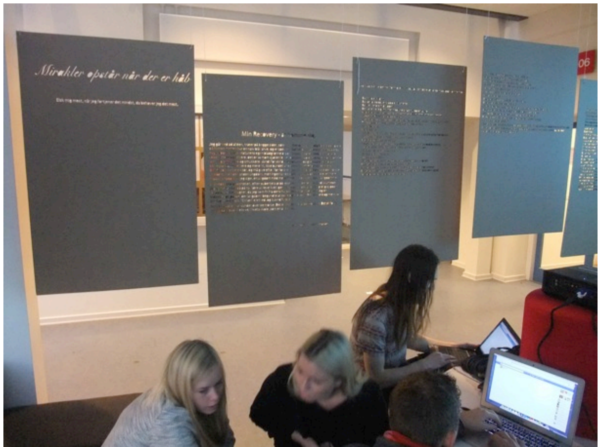
Image 6: Laser-cut cardboard elements displaying one of the stakeholder's poems – an idea initiated by the students as background to the study programme's showcase.

A number of so-called psychologically vulnerable participants, the initial target group holding the stake, attended the showcase and expressed their enthusiasm. One of these participants even gave permission to the students, upon their initiative, to transform poems she had written and presented to them earlier in the workshop into laser-cut cardboard elements (see image 6), which set the frame for the workshop's showcase by granting the visitors insight into artistically transformed experiences of being considered a psychologically vulnerable stakeholder.