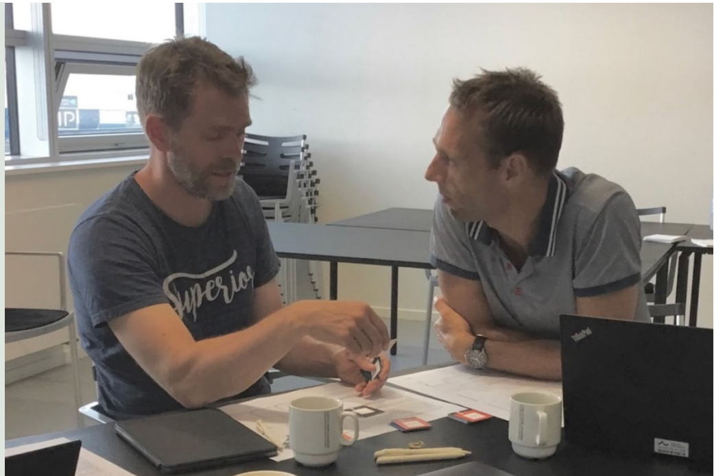
Figure 4: Educators discussing the core pedagogical features of their common course

Dialogue is relevant during both the initial design process and later follow-up. During the initial phases, some educators may have existing experiences related to the design opportunity (see Tip 1) that are worth sharing as well as important knowledge about the context, subject area, etc. In later follow-up, educators have usually gained valuable first-hand experience and even actual data on impact that other educators can learn from and use to help clarify future refinements (see Tip 5).