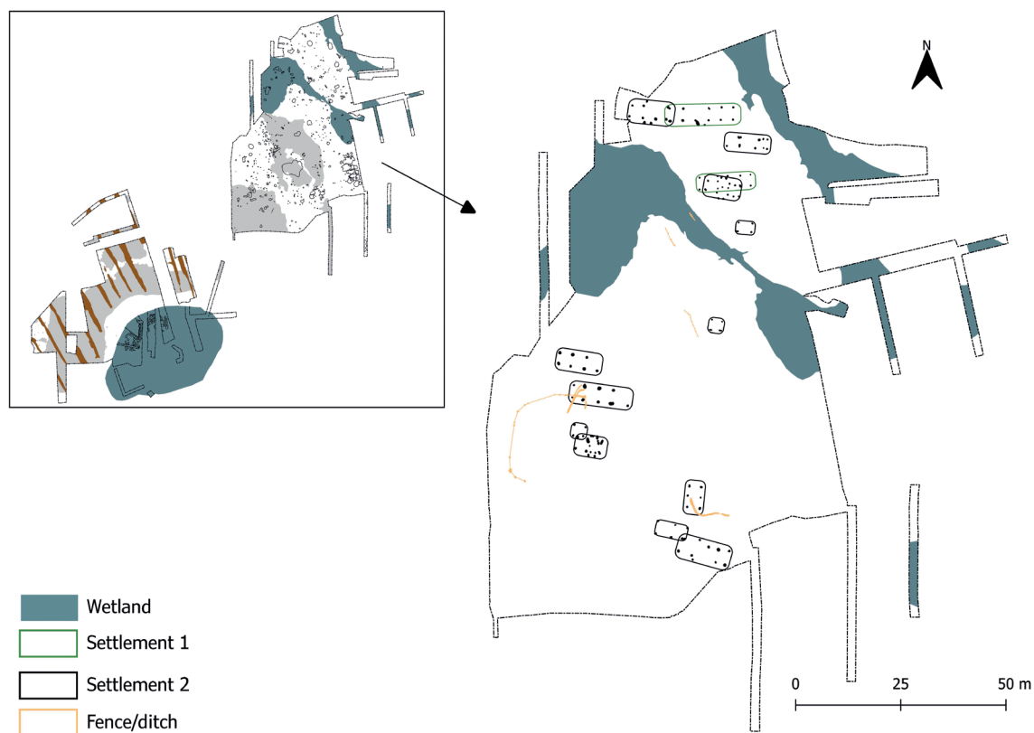
Figure 2. House plans and fences from Aldersro. Houses indicated in the same colour share the same orientation (Credit: Moesgaard Museum and the authors).

oat ( Avena sp.) and flax ( Linum usitatissimum ) were cultivated in small amounts. Throughout the PRIA, agricultural activities continued in the surroundings of the wetlands, and later, in the ERIA, rye ( Secale cereale ) became popular too. However, the archaeological record indicates that these activities decreased during the Late Iron Age, and slight reforestation took place (Aaby 2005, 8).