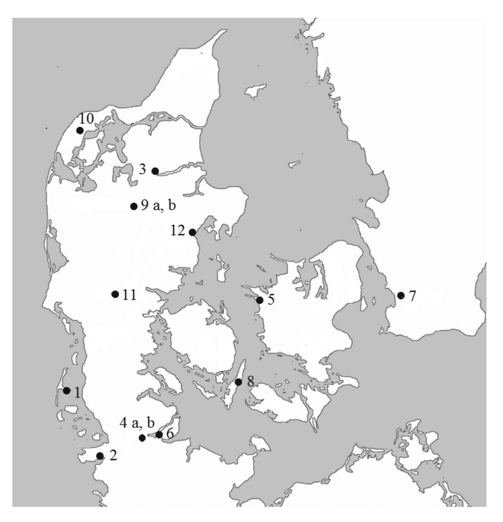
Figure 1. Map showing the locations with plant macro remains of garden plants discussed in this article. 1: Archsum, 2: Elisenhof, 3: Fyrkat, 4a: Hedeby settlement, 4b: Hedeby harbour, 5: Kalundborg, 6: Kosel, 7: Färgaren, Lund, 8: Stengade II, 9a: Viborg, St. Skt. Pederstræde, 9b: Viborg Søndersø, 10: Tinggård, 11: Vorbasse, 12: Århus Søndervold.

single find of angelica from Hedeby (Table 1) may have entered the archaeological context from natural habitats, but there is a real possibility that angelica was cultivated during the Viking Age.