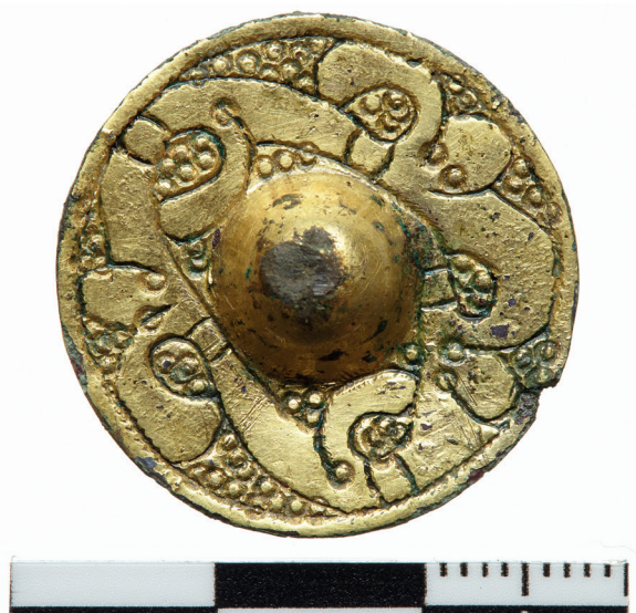
Figure 2. Gilded bronze miniature shield with elaborate decorations in Late Viking style, marked rim and protruding boss. Diameter 2.5 cm. Kirke Hyllinge, Zealand, Denmark.

Shields are depicted on picture stones and tapestries, although such depictions only provide us