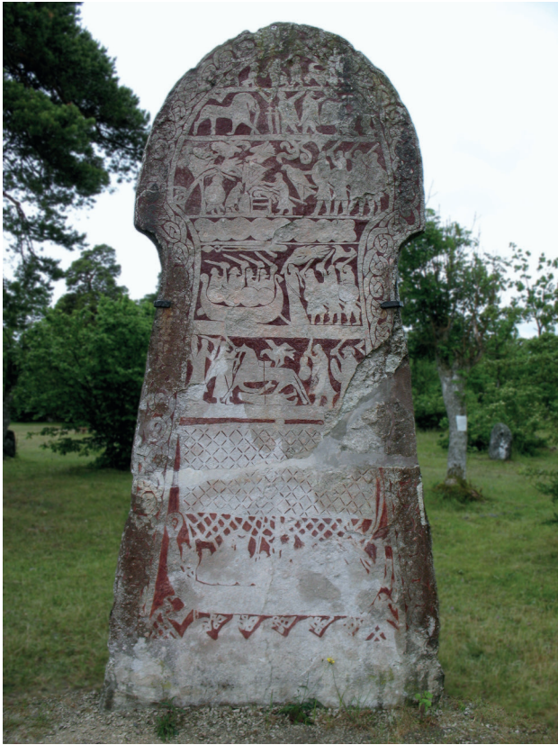
Figure 4. Picture stone from Gotland, Lärbro Stora Hammars I. The fourth panel shows a boat with sword and shield carrying men heading towards a woman who has three armed warriors behind her. The depiction has been interpreted as a scene from the legend of Hildir (Photo: By Berig, CC BY-SA 3.0),

Hildir's wheel, and the boss the hub of the wheel.' Moreover, Snorri explicates this kenning as ofljóst , meaning 'enlightened' or even 'over-obvious' (Stavnem, 2014, 325). However, the heuristic nature of how kennings are deciphered means that the cognitive processes they involve are more than just poetic devices, but more like riddles, and the ofljóst kenning could be classified as word play.