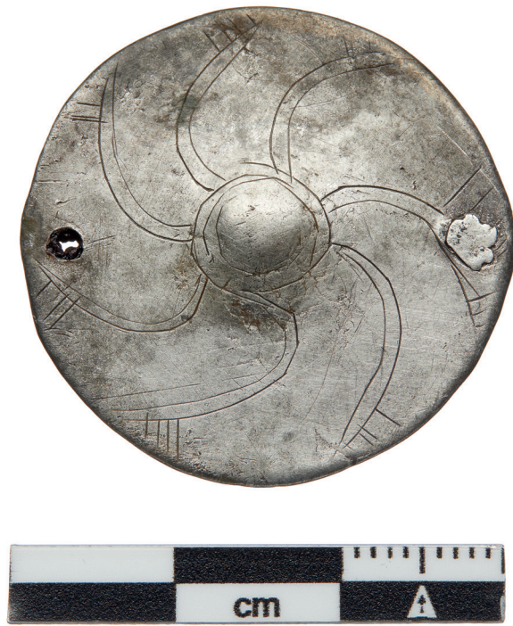
Figure 1. Silver miniature shield with incised whorls or spirals, and central protruding boss. Avnslev, Funen, Denmark. Diameter 3 cm.

about the shield. Egill later lost the shield, but retrieved its golden fittings, suggesting that its decorations were not just confined to carvings or paintings (Barreiro 2014, 124-125).