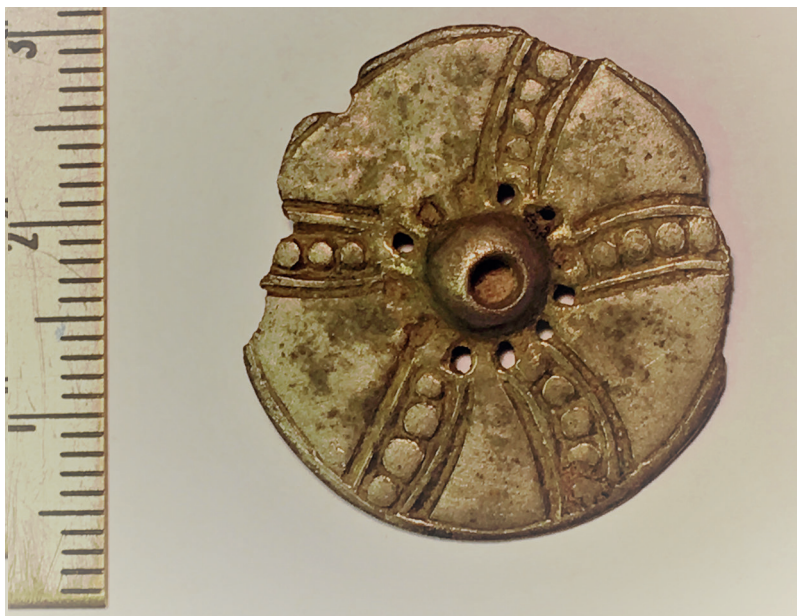
Figure 5a-b. Gilded silver miniature shield – and wheel. Neble, Zealand, Denmark. Diameter 3 cm (Photos: The National Museum of Denmark, Rikke Søgård).