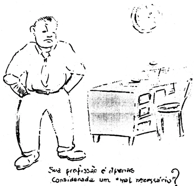
Figure 2: 'Is your profession considered just a necessary evil?' (Soares, 1955: 3)

According to the handbook, the employee had to bear in mind that his job was not ordinary. He was not expected to fulfill the essential obligations of regular employees, like being on time, not making serious mistakes, and indifferently performing his duties. The SPVEA employee would have to walk the extra mile to achieve the desired level of commitment and be fully in line with the objects of the agency: