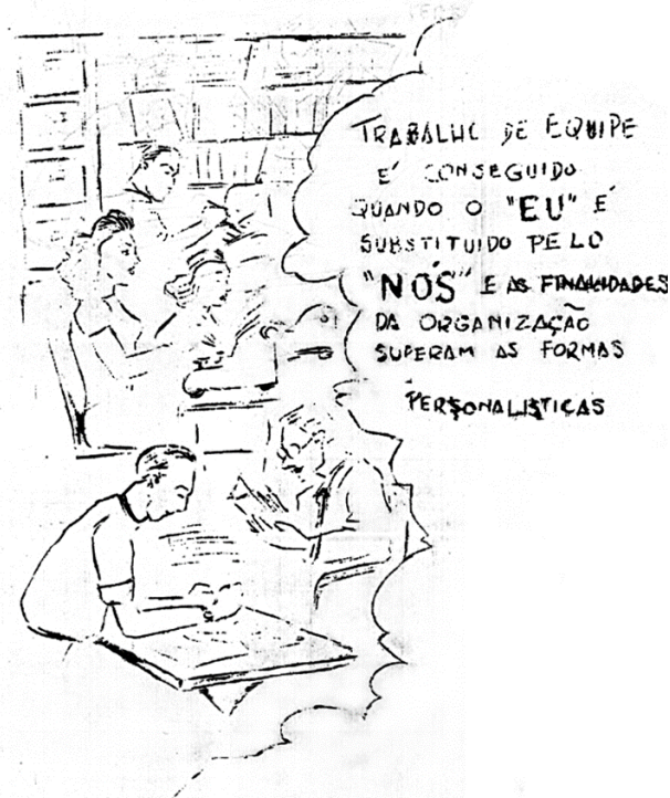
Figure 3: 'We achieve teamwork when "I" is replaced by "us" and the goals of the organization overcome personalistic modes' (Soares, 1955: 6)

SPVEA should care for the people of the Amazon so they would not have to move to big cities. The 'civilizational' features from the Brazilian coast would migrate to the Amazon region, not the other way around. The handbook contained recommendations for employees to show respect towards public affairs. Also, they should care for the population that had never received decent service, had been exploited, and had not had their voices heard by an agency established to serve them. (Soares, 1955). Lastly, caring for the countrymen would be essential for the plan to work.