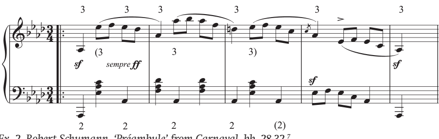
Ex. 2. Robert Schumann, 'Préambule' from Carnaval, bb. 28-32.7

Grouping dissonance is induced when two layers, whose cardinalities are not multiples of each other, conflict. Grouping dissonance can be written as the formula Gx/y , where x and y are the cardinalities of the layers and x is also the largest. The layers of a grouping dissonance will at some point share a common pulse and create some sort of short-lived consonance. Even though we have this brief consonant coincidence, we still perceive the overall interaction as dissonant. The example below will explain the grouping dissonance in practice and with more detail.