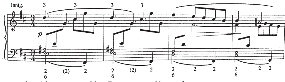
Ex. 1. Robert Schumann, Davidsbündler Op. 6 No. 2, bb. 1 - 4.5

A composition can have several layers working at the same time and it is the interaction between these layers that creates what we call metrical consonance or dissonance. Layers can be formed by several factors. It is mainly various musical accents that form these layers, such as durational-, dynamic-, density-, registral-and harmonic accents, but extended pattern repetition and new events in the music can also activate layers. These musical accents are defined and further exemplified in Joel Lester's article 'Rhythms of Tonal Music'.<sup>4</sup>