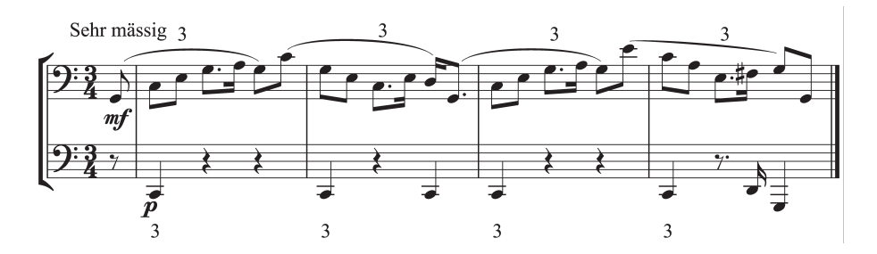
Ex. 3. Robert Schumann, Symphony No. 3, second movement, bb. 1 - 4.8

Displacement dissonance occurs when two layers with a shared cardinality interact, but are displaced with a certain number of pulses. Normally a displacement dissonance is created by the metrical layer and one anti-metrical one, but it can also be two anti-metrical layers alone. The number of pulses which separates the two layers is called the displacement index. Displacement dissonances can be written as the formula Dx+a, where 'x' is the shared cardinality and 'a' the displacement index.