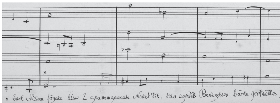
Fig. 3. One of Knud Jeppesen’s annotations in his string quartet-MS reflecting Carl Nielsen’s advice. The two eight notes following the ‘X’ marking (bottom voice) possibly added by Nielsen himself; DK-Kk, KJ-A, IV, 11.

While A1-A4 are all located in S9 the three other annotations to the first movement can be found in their own sections. The wording of A5 (in S1) is: “Carl Nielsen added these 2 passing notes, he thought the movement ought to be continued” (Fig. 3). 70 In contrast to the foregoing remarks’ general character this is a detail, and the two notes in question are added immediately, before later becoming part of the fair copy.