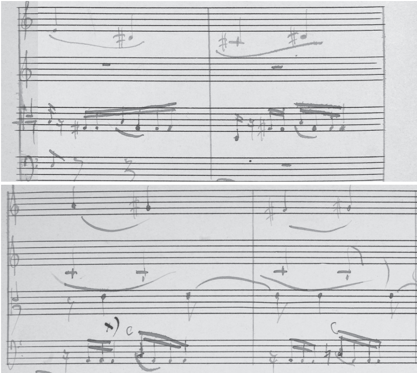
Fig. 4. Excerpts from Jeppesen string quartet-MS, 2nd movement. 'X' marking and "c" (bottom voice) indicate Nielsen's recommendation; DK-Kk, KJ-A, IV, 11.

Despite this quite detailed presentation of the – rather few – surviving sources from Jeppesen's studies with Nielsen we are left with a somewhat less than clear picture of Jeppesen's training in chronological terms. Jeppesen says that he "began to study with C.N." in the autumn of 1915 and that this lasted for a couple of years, that is until the autumn of 1917, 76 and Table 3 shows the safe datings touching upon this period compared to which study-exercises Jeppesen says he tackled, supported by the surviving manuscripts.