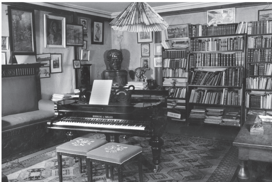
Fig 3. Carl Nielsen's music room, Frederiksholms Kanal.

Life in Frederiksholms Kanal did not directly influence Carl Nielsen's musical style, but he enjoyed being near to several important institutions. Just behind the residence in a more modern part of Copenhagen was Tivoli and nearby in a new building housing the Music Conservatoire.