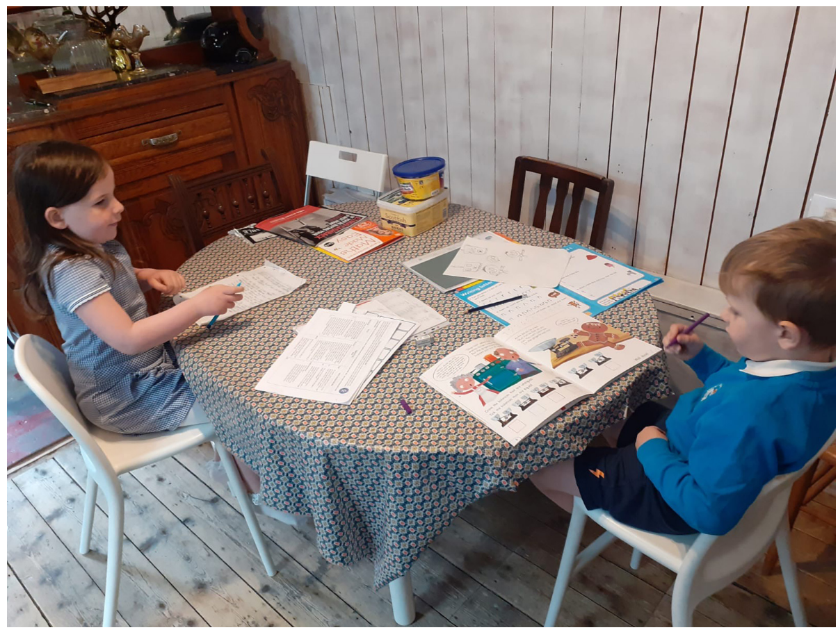
Fig. 12 Children dressed for home-schooling in their School uniforms, May 2020, Galashiels, Scotland.

Three themes were identified in the analysis of this survey: