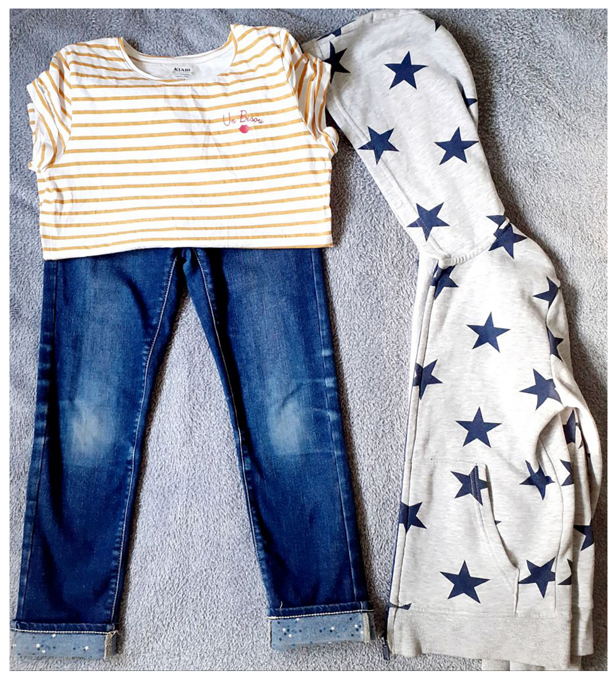
Fig. 11 My preferred home-schooling outfit, from a 12 year old girl, France.