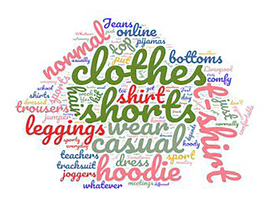
Fig. 10 Word cloud from the questionnaire »Dressed for Home-schooling«, April-June 2020, 6-12 years old.

The coding phase implied for the researchers to be able to overcome the problems related to the vocabulary used by children, their description of clothes using vernacular or distorted words, and their tendency to use comparative or default answers to describe the changes in their habits: for example, »...whatever clothes are in hand« / »I don't wear the same as at school« (without any indication of what is worn at school)... Therefore, thanks to the contextualisation of the answer and comparative approach with the visual information, further interpretation has been possible.