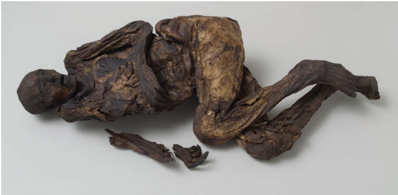
Fig. 1. Huldremose Woman as she survives today.

recognised that it had been fastened with a bone pin underneath the left arm. The lower part of the body was covered by a long skirt and the feet were bare. According to the find description, the long red hair was tied at the neck with a wool cord, which was also wound several times around the neck. The hair is now missing.