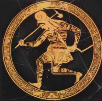
Fig. 2. Bowl 2644, c. 480 BC, Munich, Staatliche Antikensammlung (From Starke Frauen 2008, cat. 21).