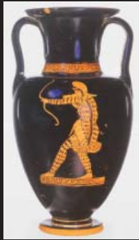
Fig. 1. Amphora 2342, 430 BC, Munich, Staatliche Antikensammlung (From Starke Frauen 2008, cat. 7).