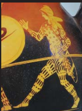
Fig. 12. Amphora 2342, 430 BC, Munich, Staatliche Antikensammlung (From Starke Frauen 2008, cat. 7).