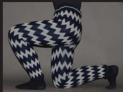
Fig. 14. Colour reconstruction of Paris as archer from the western gable of the Aphaia-Temple, c. 490–480 BC, by V. Brinkmann, Munich Glyptothek. (From Brinkmann 2004).