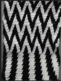
Fig. 4. Simple vertical stripes are obtained by interlinking. By intertwining the colours alternately one can obtain a small zigzag pattern. (© Drinkler).