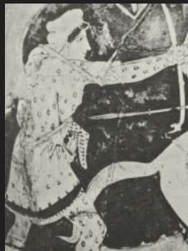
Fig. 10. Detail on bowl Pell. 278, c. 450 BC, Bologna, Museo Civico (From CVA Bologna 1960)