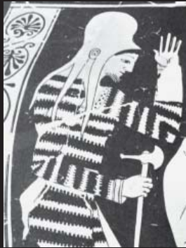
Fig. 8. Detail on amphora HA 120, c. 500 BC, Würzburg, Martin von Wagner Museum (From CVA Würzburg 1981)