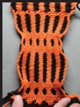
Fig. 13. Bowl 2644, c. 480 BC, Munich, Staatliche Antikensammlung (From Starke Frauen 2008, cat. 21).