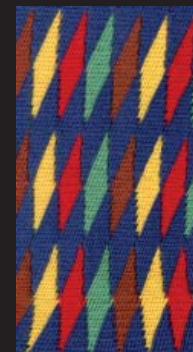
Fig. 7. Two-layered sprang with long lozenge pattern as found on the Persian horseman.