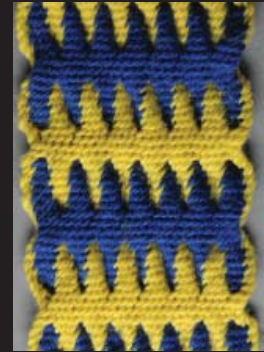
Fig. 9. Horizontal stripes with uneven borders.