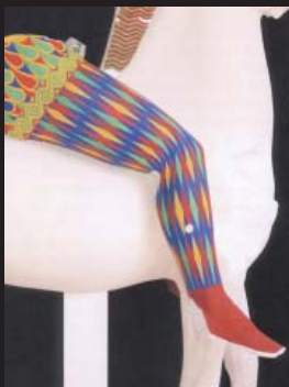
Fig. 6. Colour reconstruction of so-called Persian horseman in the Acropolis Museum in Athens, c. 490 BC by O. Primavesi (From Brinkmann et al. 2008).