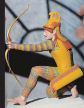
Fig. 3. Colour reconstruction of Paris as archer from the western gable of the Aphaia-Temple, c. 490–480 BC, by V. Brinkmann, Munich Glyptothek. (From Brinkmann 2004).