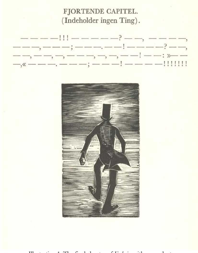
Illustration 1: The final chapter of Fodreise with a woodcut by Povl Christensen (1940).

Andersen's adventurous peripatetic advance into literary space is above all an unbridled, imaginative potpourri in which everyday logic – in a temporal as well as a spatial sense – is turned upside down and ultimately leads to the complete derailment of the text, as the book ends with a chapter without words, consisting exclusively of punctuation. Finally, the narrator and the author fall short of words and can only offer the frame of the text, not the narrative substance itself. At the end of the story – and the journey – it is now the task of the reader to fill the blanks or maybe just let the textual emptiness speak for itself. (See: illustration 1).