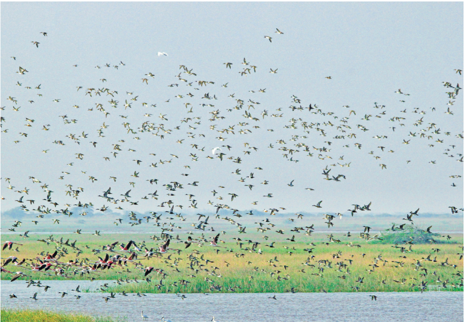
Photograph: Avian biodiversity at the Mokarsagar wetland, India