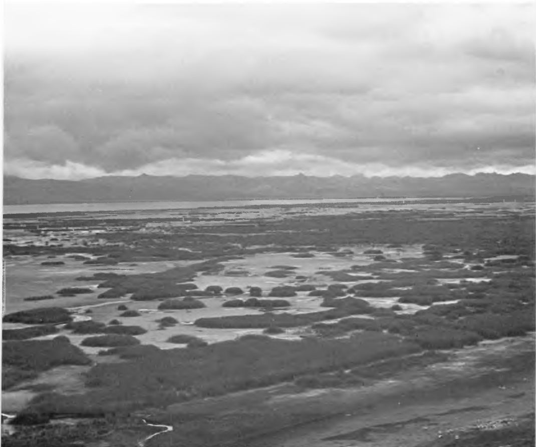
Figure 3. Lake Junin at Poclocancha in October 1979. In May the water reached right to the fore-ground.

The situation had changed by October and 47 grebes were recorded in water 1 m or less deep on the outer edge of the reeds including 34 birds in the south corner of the lake—a place where J. Fjeldså (pers. com.) noted numbers in 1977–78. A further 28 grebes (including a pair with one half-grown young) were seen during the transect across the centre of the lake with the majority (23) north-east of Poclocancha in 5 m of water. It is not possible to estimate the population from these counts as water conditions, and therefore the range of sightings, varied greatly during the survey.