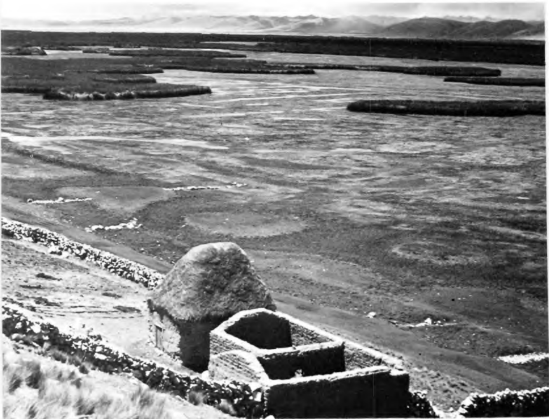
Figure 2. Shallow pools on the landward side of the reed-beds at the southern end of Lake Junin. The lake itself is just visible in the distance. October 1979.

I visited much of the lake margin 18–23 May and 5–10 October 1979. I had an inflatable boat so for the first time the centre of the lake was systematically covered. Counts were made in sample areas of various habitats and the populations estimated by extrapolation using total areas calculated from maps. In most places 5–10% of the area was counted. Endemic