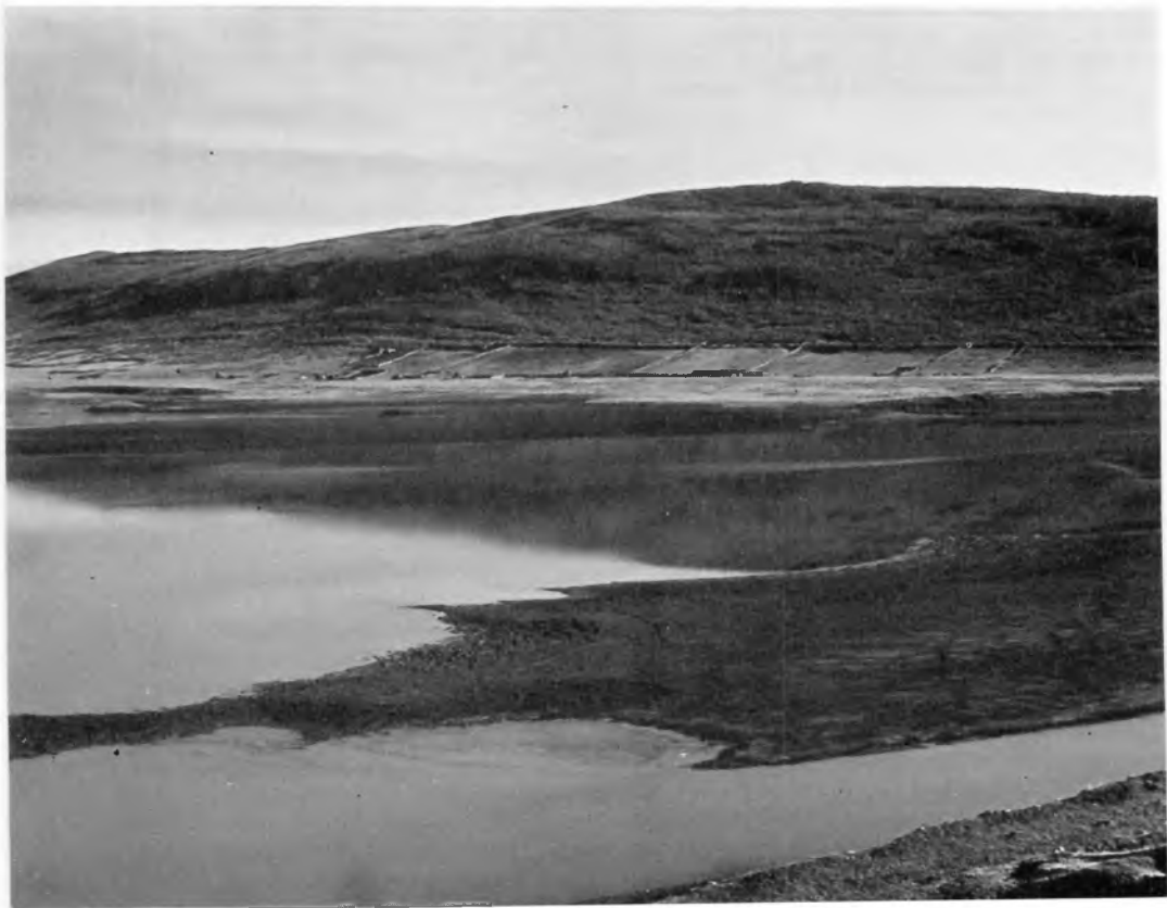
Figure 5. Upamayo Pond in October 1979. Before the building of a dam and weir in 1933 this lake was many m deep. Now it is filled up with silt from mines upstream and stained red with flocculant iron precipitates.

The endemic grebe utilizes both the deep water in the centre and the outer reed-edges during the breeding season. These habitats are quite separate. In May 1979, the bulk of the population was in water more than 5 m deep. Presumably deep water is the preferred habitat, although birds must visit shallow water to breed, but the species may be forced to go there because of competition with the very numerous White-tufted Grebe. Whatever the reason, the endemic grebe's habitat in May was the deep area of the lake where there is 4–7 m of water even in the driest year. Although the grebe was once thought to occur on other nearby lakes, these re-