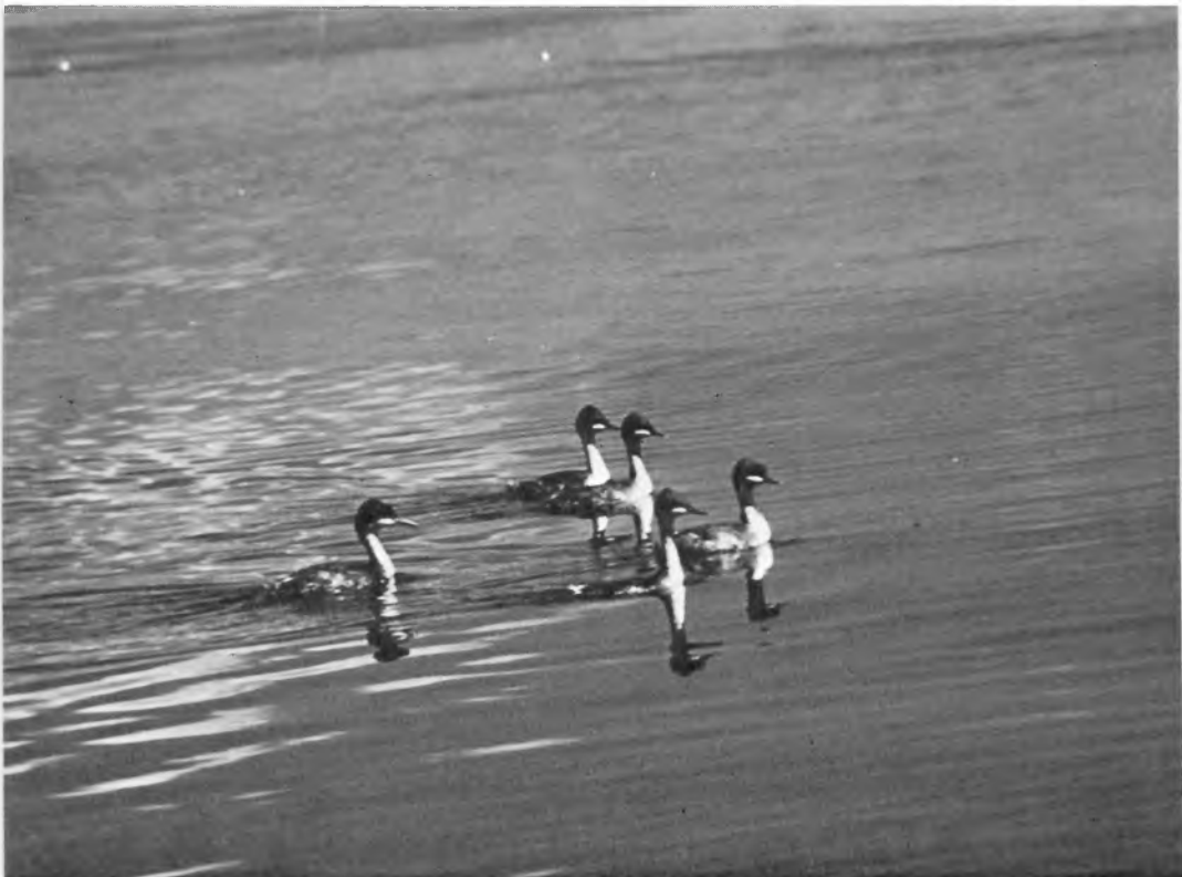
Figure 4. A group of flightless Junin Grebes in glassy calm condition, May 1979.

3. Data from Morrison (1939), Dourojeanni et al. (1969), Petterson (1979), Fjelds  (1980) and my own records.