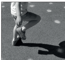
Figure 12. Rapid and fluent bodily coupling of dots