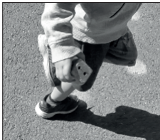
Figure 8. Mental retrieval and action