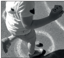
Figure 10. Tagging the largest addend

Lisa showed mental and physical fluency with tasks where the smallest addend was less than and sometimes equal to four (e.g. 5 + 2 , 5 + 3 , 6 + 3 and 6 + 4 ) and she did not look at the die after entering the circle (figures 11–13). The following excerpt exemplifies the strategy pattern when the smallest addend was larger, starting after the dice showed 6 and 6.