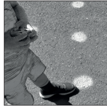
Figure 19. Same finger-tagging two steps and number words later, cf. figure 18