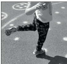
Figure 16. Swing-phase in mapping "nine"