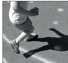
Figure 11. Rhythmic mapping of the ordinal structure