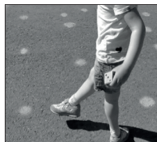
Figure 13. Bodily rotation in expressing the sum