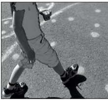
Figure 6. Visual retrieval and gentle movement

The comparison of the children's task behaviours revealed four categories of modelling the min strategy (see table 1), and the characteristics associated with these categories are elaborated below.