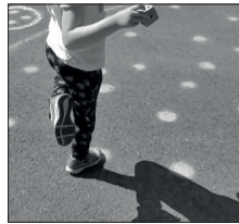
Figure 15. Initial phase in mapping "nine" on the 6 + 3 task