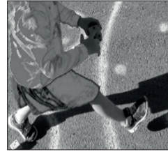
Figure 3. Touch counting (from stage 2 to 3)