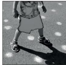
Figure 21. Tagging error

The task behaviour of Kevin is characterised by subitising and pattern recognition of dice faces 1 to 6 and verbalised physical tagging of the larger die. Inside the circle with 100 dots and guided by the other die, he started counting from "one", using visual retrieval for numbers one and two while opting for touch counting for larger numbers. However, the use of visuo-tactile support is error-prone as unique finger-tags frequently map onto multiple number words and feet touching dots (e.g. on 3+3 , 3+4 , 6+5 , and 5+5 ; figures 18 and 19). Moreover, the bodily movement was stiff and the speech was monotone.