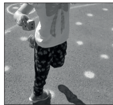
Figure 17. Completion of rotation in mapping "nine"