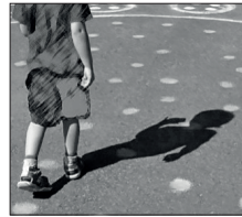
Figure 9. Incongruent modelling in the form of tagging error

The analysis shows that the major differences in strategy modelling were reflected in the degree of offloading of the cognitive work in the counting-on part of the min strategy (see "Representational mode in stage 3" in table 1). In particular, two children preferred visual retrieval of numerical information from the handheld die (figure 6), four opted for visuo-tactile support (i.e. touch counting, figure 7), and two relied on mental representations (figure 8), while two showed flexibility across