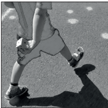
Figure 20. Ignoring the handheld die