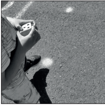
Figure 18. Unique touches mapped onto multiple number words and dots on the ground

The two children in this category of task behaviour mastered the more-and-less relation (i.e. comparing the value of both dice) and their embodied interaction reflected several non-verbal aspects of the min strategy. However, they were unable to link the action verbally in a manner consistent with the logic of counting-based addition.