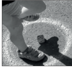
Figure 2. Tagging of the largest integer (stage 2)