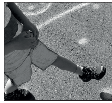
Figure 7. Touch counting and stiff gait