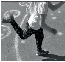
Figure 14. Fluency in physical coupling

From a physical perspective, Anna's modelling of the min strategy may be characterised as a goal-directed and fluent expression of the largest addend and the ordinal structure (figure 14) followed by a bodily rotation in expressing the cardinal value (figures 15–17). The combination of motor fluency and verbal modulation was especially evident when the smallest integer was within subitising range, as the final tagging included extensive articulations (e.g. shouting "nine") in synchronisation with bodily rotation.