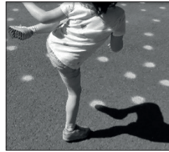
Figure 5. Physical expression of the sum (stage 4)

children showed the ability to distinguish between the quantities represented by the two dice (i.e. the more-and-less relation), and all except C4-knower Mark picked up the die with the smallest addend.