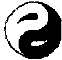
Figure 2. A twofold picture.

The two types of activity constitute each others' 'other' – but they each also give form to the other. The students' perception that the content in the exercises is meaningless (except as an element of institutionalized schooling) helps to shape the informal situations.