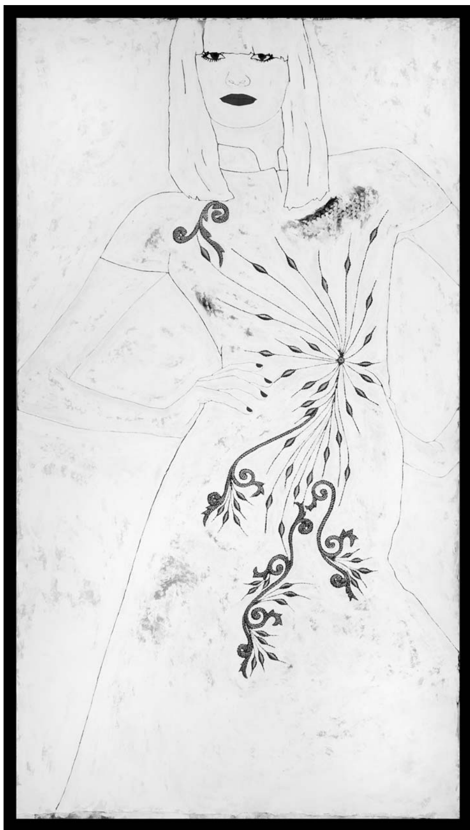
Iben Dalgaard: I suppose we are all pro pose.