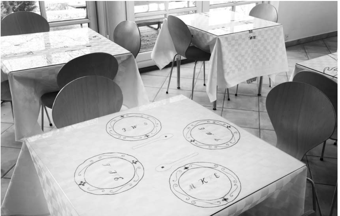
Iben Dalgaard: Be My Guest, 2011. Broderede Georg Jensen damask duge. Samarbejde med Place de Bleu. 165 x 165 cm.