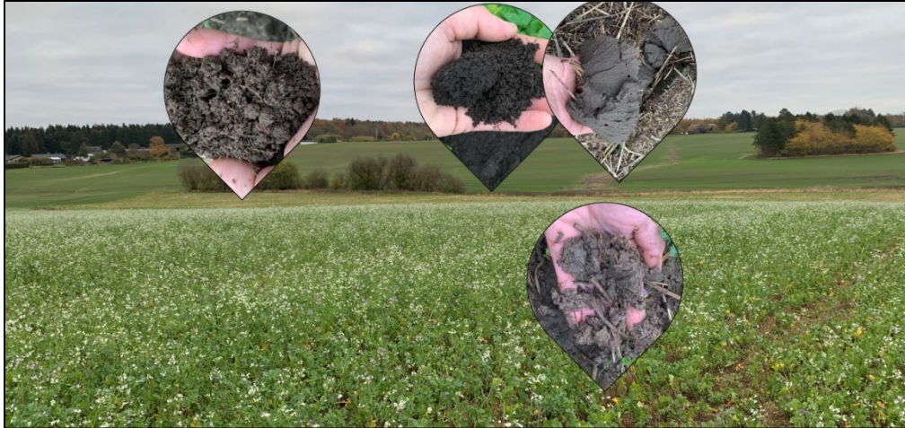
Fig. 1. Examples of information about the sampling area provided to students to support the design of their sampling campaign. Top: Orthophoto indicating land use categories. Bottom: Visual documentation of soil conditions at selected locations within the area.

Each laboratory group in the course has the capacity to analyze three soil samples. With eight groups, this allows for a total of 24 samples. To enable a meaningful investigation – one that could cover multiple soil depths and include replicates – I asked the students to collaboratively develop a single, shared experimental plan.