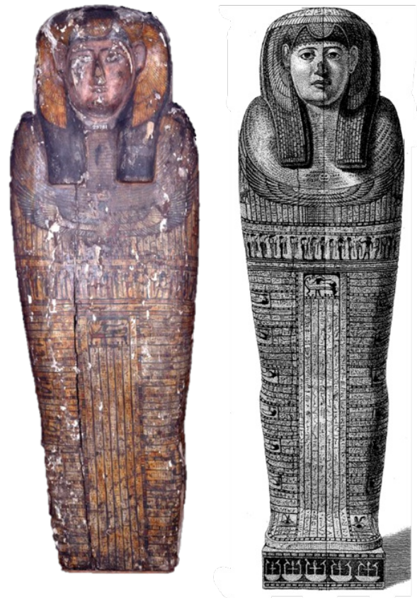
Figure 1: A picture of the coffin of Irtysenu today (left) and a drawing of the coffin from 1825 (right).

The autopsy of Irtysenu began on the 21st of August 1821 and continued for the next six weeks in the drawing room of Dr. Granville in London. In contrast to other mummy unwrappings in the 19th century, which had little to no documentation, Dr. Granville only invited various prominent people of the time to observe the procedure and provided detailed documentation of all of findings in a final report (Clinker, 2024: 110-111; Riggs, 2016: 113). The report itself started by describing all exterior findings, such as her wrappings and decorations, before turning to the surgical blade, choosing to 'sacrifice a most complete specimen of the Egyptian art of embalming' (Granville, 1825: 281) to fulfill his inquiry of the state of preservation of her body (Granville, 1825).