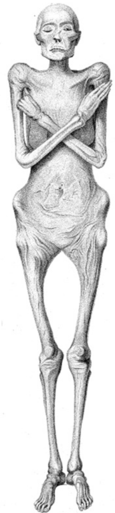
Figure 2: Drawing of Irtysenu after unwrapping.

In the present day, it is known that the pyramids of Memphis (Giza) were built during the Old Kingdom (2675-2130 BCE), and the king described by Herodotus, Sesostri the Great, is believed to be a combination of Senwosret I (1920-1875 BCE) and Senwosret III (1878-1839 BCE), two great Middle Kingdom (1980-1630 BCE) pharaohs (Dieleman, 2010: 441; Herodotus: II, 102). In 1821, the understanding of ancient Egyptian history was limited.