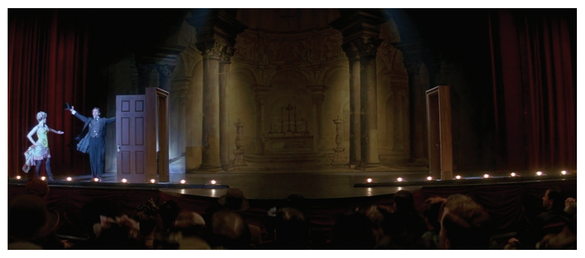
Figure 3: The Transported Man, magic trick - B.

But consider, following Mauss, how disbelief is always historically situated. We can imagine for instance how nineteenth century audiences would have probably found equally incredible that a person could fall asleep in London one day and wake up in Manila the following day, and how before air travel became common in everyday life this too could have easily been construed as magical. From this perspective, the illusion of teleportation is only a function of our perception of the time needed for the necessary transformations required to displace matter in space. Consider then, how the illusion of travelling at the speed of light is profoundly connected with the social imagination about technologies like electricity, radio, the telephone, and indeed the kinematograph, in the early twentieth century.[4] John Cutter, the ingenieur working with Angier (played by Michael Caine in the film), at one point advises the performer: "if you need some inspiration, there's a technical exposition at the Albert Hall this week. Engineers, Scientists,