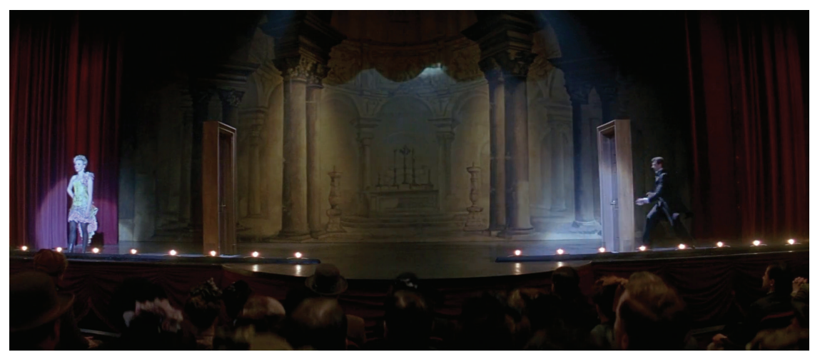
Figure 2: The Transported Man, magic trick - A.

The plot of the film is structured as a series of flashbacks in which the magicians take turns at reading the other's stolen diary. Much like the generator and discriminator modules in a GAN,[3] their rivalry pushed the boundaries of magic, albeit in very different ways: Borden and his twin accomplish the illusion by concealing a lifetime of duplicity,